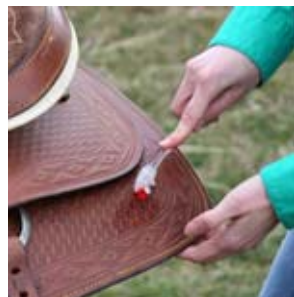
Use a toothbrush to make sure no soap residue remains in the tooling.

Before your tack is fully dry, work in a conditioner or leather oil to keep the leather supple and prevent it from drying and cracking. Many riders overuse oil with the intention of preventing the tack from drying out. There is such thing as too much oil, and over-conditioning your tack can make it flimsy. Avoid getting oil around the stitching on your saddle as it can rot away the thread over time, leaving you with unsafe tack and costly repairs.