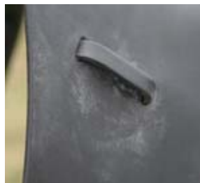
Tack kept in damp conditions will often grow mildew and mold.

In a perfect world all tack rooms would be climate-controlled with dehumidifiers running full-time to protect leather from mold-friendly moisture. In the real world, damp weather in less-than-ideal storage situations means mold and mildew are a reality for many riders. Moldy leather has a white or greenish powdery substance on it. If left for a long time or in especially damp conditions, the mold can take root and cause serious damage.