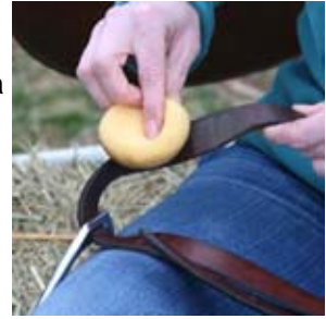
Pay special attention to parts of tack that are subjected to a lot of wear, such as stirrup leathers.

Riders put their tack through a lot of abuse. The dirt, sweat and horse slobber that saddles and bridles are subjected to in their daily use can break down the leather and stitching over time. While few riders have the time to give their tack a thorough cleaning after every ride, it's important to make sure you don't let the dirt get out of hand.