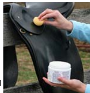
Apply conditioner after cleaning while the leather is still slightly damp.

Start by wiping off any excess dirt from the surface of the leather. Then use a damp—not wet—sponge or cloth to work your soap into the leather. Small tack sponges, available inexpensively at any tack shop, are ideal because they are soft and non-abrasive, and small enough to get into all areas of the tack. Make sure you concentrate on the areas around the buckles and the folds in the leather by the reins and in your stirrup leathers. Wipe off any excess soap residue with a damp cloth.