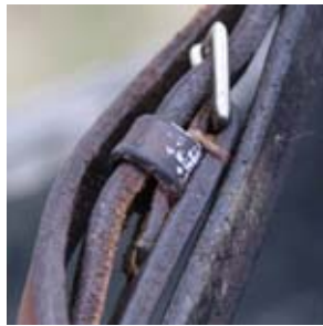
Make sure you keep your tack dry. Mold thrives on damp leather.

If you take a few steps to get rid of some of the superficial dirt after each ride, it will save you time and effort when you do attempt a major cleaning.